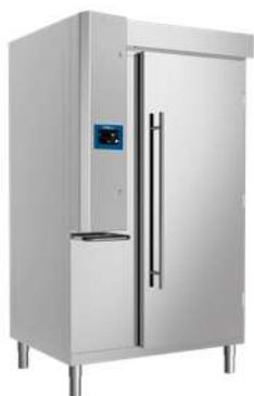
1 oven trolley EN1-GN1/1