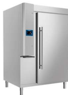
1 oven trolley EN2-GN2/1